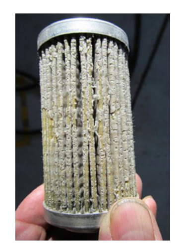
Figure 2. DEF crystals in fuel filter.