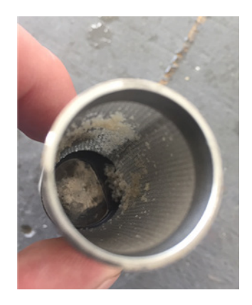
Figure 1. Fuel screen contaminated with DEF crystals following the 2019 fuel contamination event.

At both airports, all 12 aircraft that were directly exposed to DEF experienced service difficulties and unplanned diversions resulting from clogged fuel filters and fuel nozzle deposits (see the special airworthiness information bulletins [SAIBs] listed below for more information).